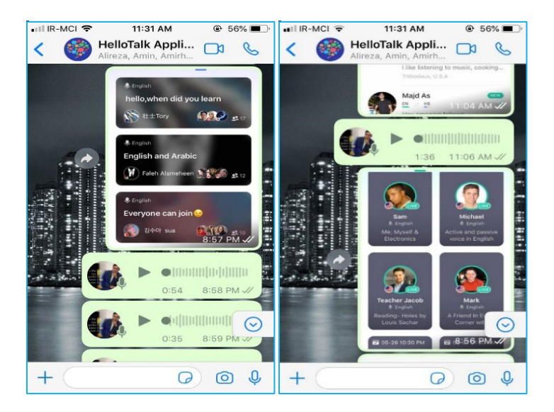
Figure 2: Introducing the HelloTalk Application on WhatsApp

During weeks 3 to 4, learners in EG1 were supposed to complete the study units in the application for 2-3 hours per week and answer the inside and outside of the class activities using the HelloTalk application. Moreover, learners had the opportunity to discuss online with the instructor. Over the next few weeks (during weeks 5 to 8), they were motivated to share and discuss the material in the chat room, where the instructor could encourage EG1 learners and provide structured comments. In week 6, the instructor tried to focus on the application's entertainment and gamification aspects to consider its fun and appealing aspects and introduce these particular parts of the application. Furthermore, the writing and grammar tools of the application were explained to EG1 learners because EG2 learners had some writing and grammar tasks or activities that the institution designed for each semester. Finally, in weeks 7 to 8, the participants completed a questionnaire. The research procedure is summarized in Figure 3.