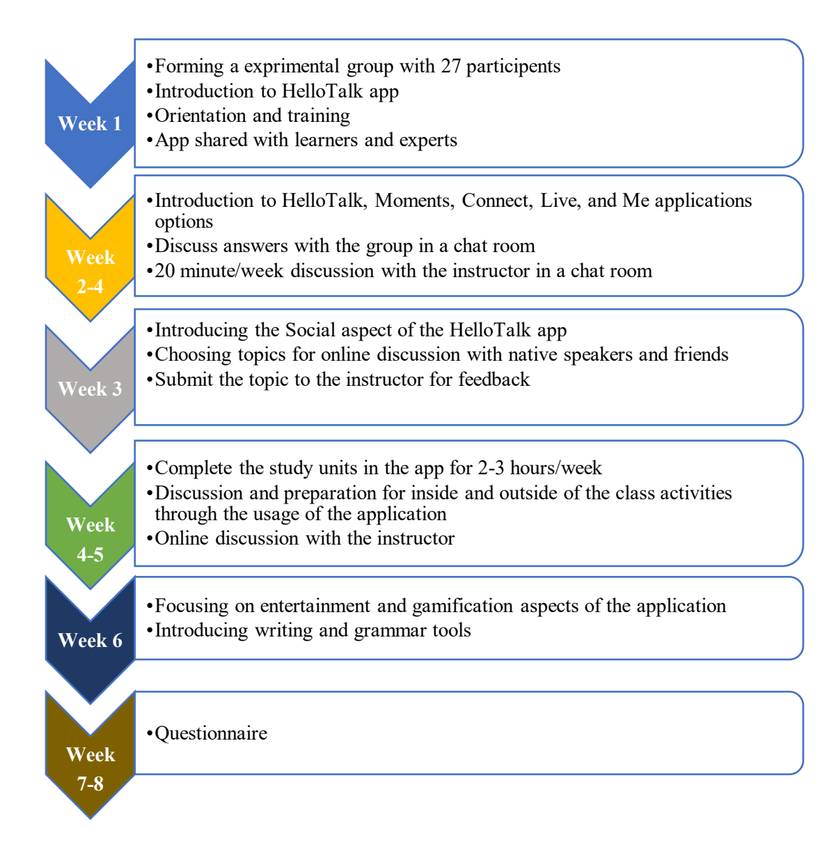
Figure 3: Research Procedure

One also should not overlook that, to bring a visual aspect to the study, some participants were asked for permission to use their screenshots and personal information, as seen in Figures 1 and 2.