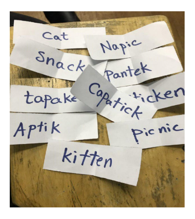
Figure 3: Teacher-made cards for blending