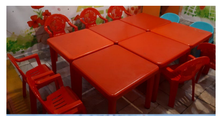
Figure 2: Setting of chairs and tables in one of the classrooms

After completing the whole-institute activity, the YLs enter the class, sit around the tables in a circle or semi-circle while putting their backpacks beside themselves on the floor (Figure 2). The number of girls is more than that of boys in all four classes. Moreover, the students often call their instructor teacher or add Miss to the beginning of her first name. At the beginning of each session, approximately 30-45 minutes are devoted to warm-up. It makes up a large part of class activity in which the learners introduce themselves one by one to their classmates. In this part of the activity, the children find the opportunity to speak and talk about themselves. However, the teacher tells them what to talk about. Depending on the level of students, warm-up is divided to two stages, Answer Me and Introduce Yourself.