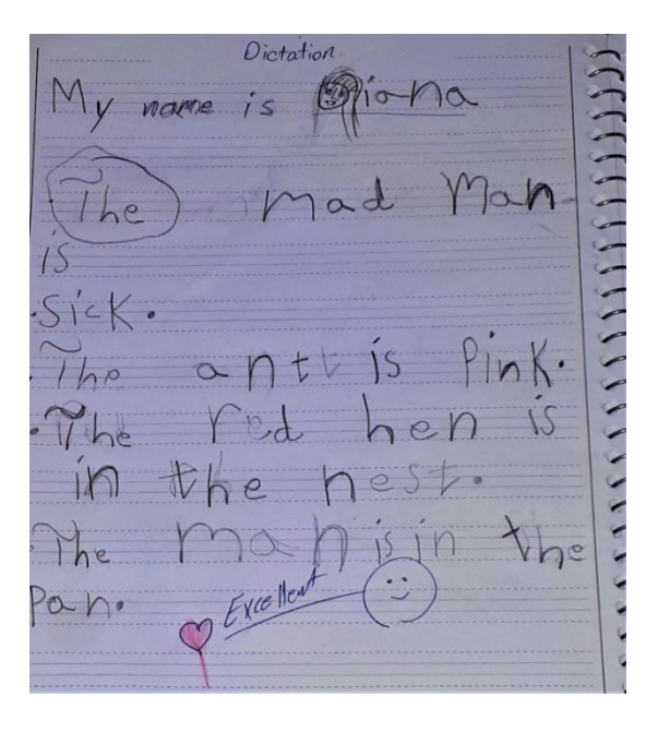
Figure 5: Sample dictation of a 5-year old learner in Ph2A

She goes on with the questions followed by negative answers such as, what are they doing? Are they sleeping? No. Are they reading? No. Are they eating? No. So, what are they doing? The students keep looking at the picture in silence. The teacher continues while drawing the students' attention to the drum on the page: Look here, there is a drum, yes? They are banging at the drum. Then, she starts doing the action of banging at the drum while verbalizing, d-d-ddrum, d-d-d-drum. Making the students familiar with the action of new letter sound, the teacher then goes on with teaching the 'formation'. She first draws two lines on the board and writes the capital and small form of the letter while performing and verbalizing its action. As an example, for the formation of 'd', Miss Neda said: up to down, round. Capital d-d-drum. Then she went on with the small letter, up to down, down to up, round. Small d-d-d-drum. Repeating the formation for a couple of times, the teacher asked the students to come to the board one by one and read, trace and write both capital and small forms of 'd'. Afterwards, the teacher continued with blending. She wrote the new sound with a red marker and started blending with other sounds, mad, mad; d-ad, dad; r-ed, red, and the like, which are later assessed in dictations (Figure 5).